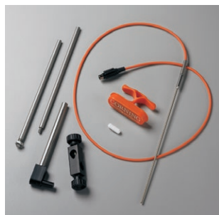
Digital hot plate accessories

When used with the digital hot plate or stirring hot plate, the external temperature controller ensures precision temperature accuracy of the liquid inside the vessel as opposed to the temperature of the hot plate top.