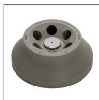
6 x 50 mL fixed angle rotor (Cat. No. 480136)