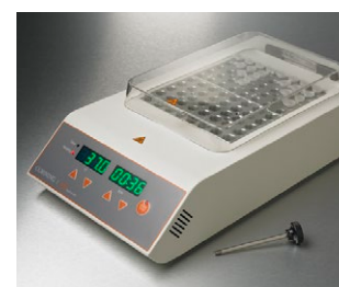
Four block digital dry bath heater