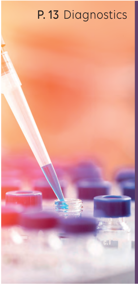
P. 13 Diagnostics