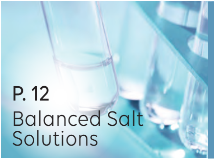
P. 12 Balanced Salt Solutions