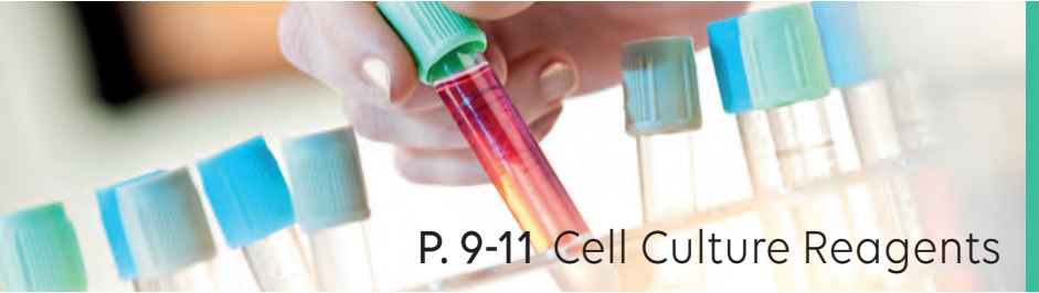
P. 9-11 Cell Culture Reagents

P. 14 Order | P. 15 Payment terms | P. 15 Product warranty