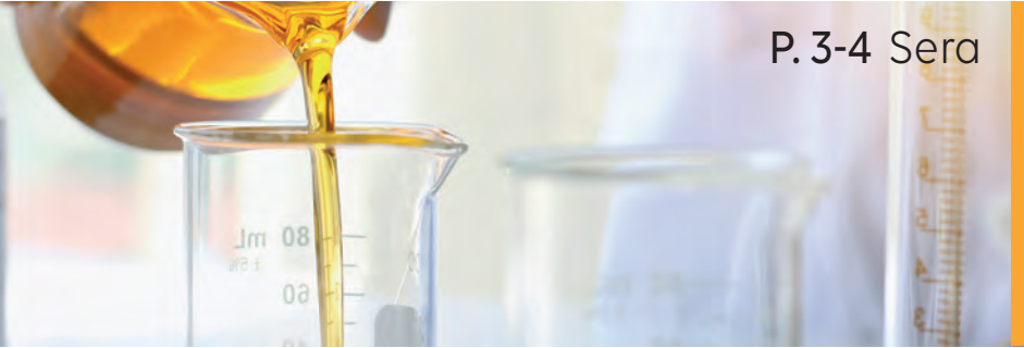
P. 3-4 Sera