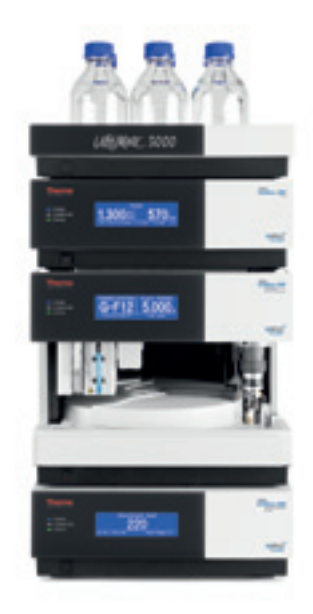
Thermo Scientific Ultimate 3000 Standard System