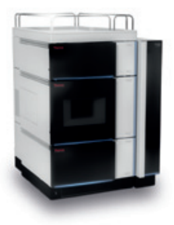
Thermo Scientific Vanquish Flex UHPLC System