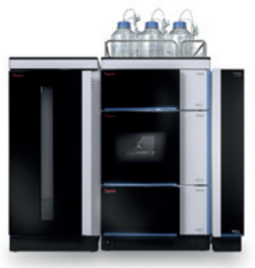
Thermo Scientific Vanquish UHPLC System