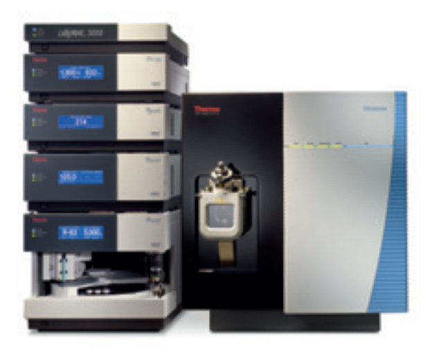
Thermo Scientific Endura Triple Quadrupole Mass Spectrometer