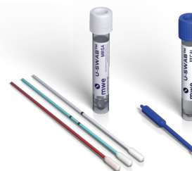
U-SWAB™ Liquid Transport