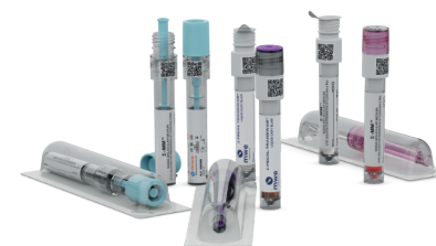
SampleSUITE™ + U-SWAB™ Liquid Transport